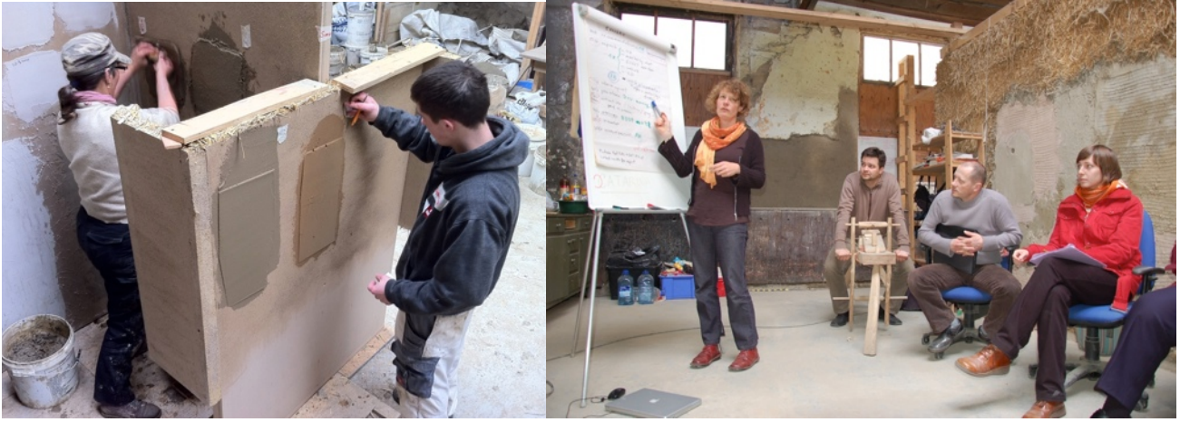
Meeting in UK. Observing ECVET exams of clay plastering Unit 1 and 2. Participating as assessors and observers, evaluating and processing the feedback.