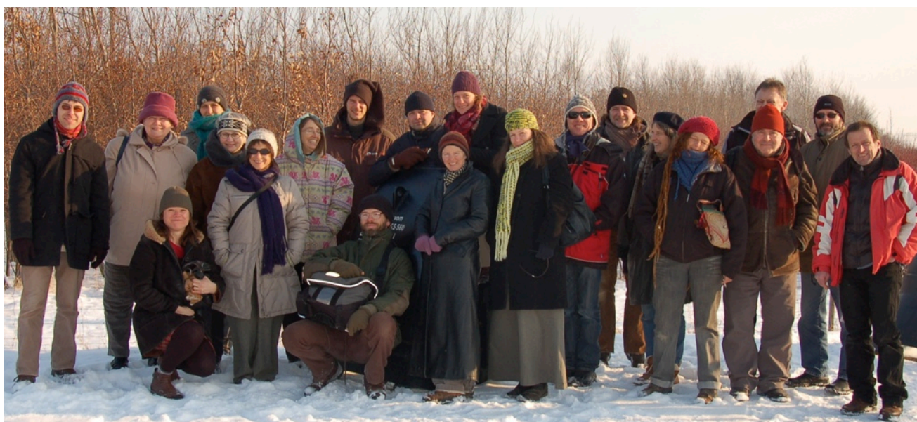
Photo: Partners of the project. Photo taken in the meeting in Germany.

The ECVET Earth building system has been disseminated in all the partner countries by different activities like presentation on web sites, conferences and press reports. The results of the project will be practically used by all the partners as they are inseparable part of the ECVET training and examination run by partner organizations. In this way the sustainability of the project results is naturally provided and unquestionable.