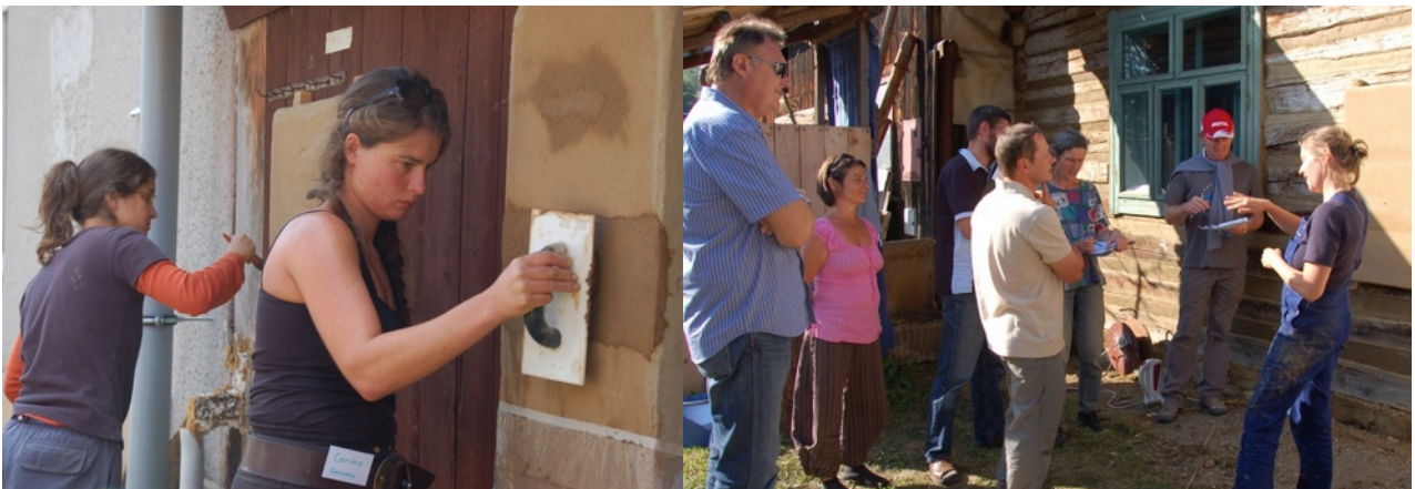
Meeting in Slovakia. Observing ECVET exams of clay plastering Unit 3 and participating as assessors and observers.

Organizer: Sdružení hlineného stavitelství, o.s.